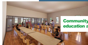
Community room for education and workshops