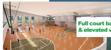
Full court basketball courts & elevated walking track