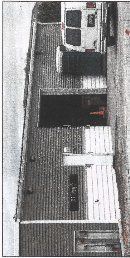
The site of a proposed crematory at 314 Tiffany Court in Champaign.