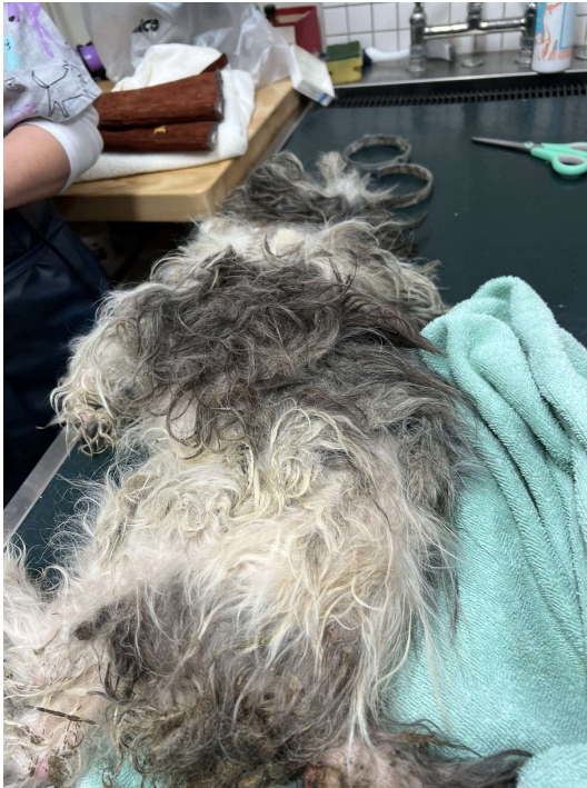
Shih tzu male stray, unclaimed