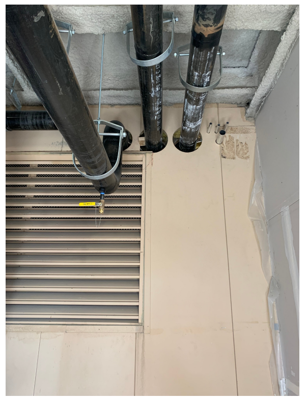
Mains ran through penetration into Penthouse 1.