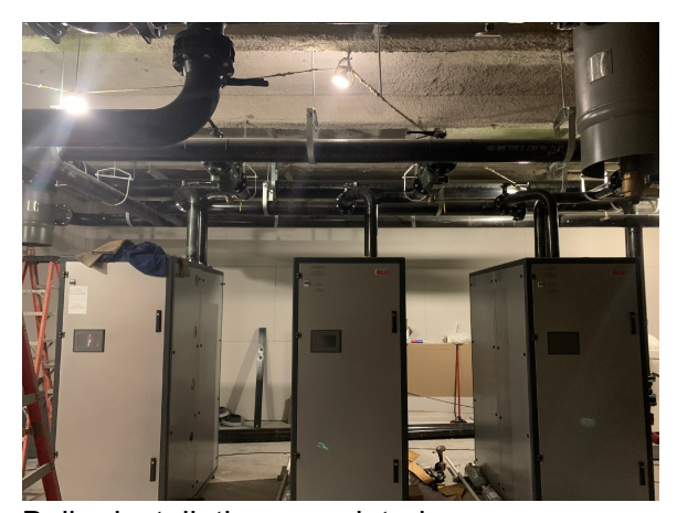
Boiler installation completed.