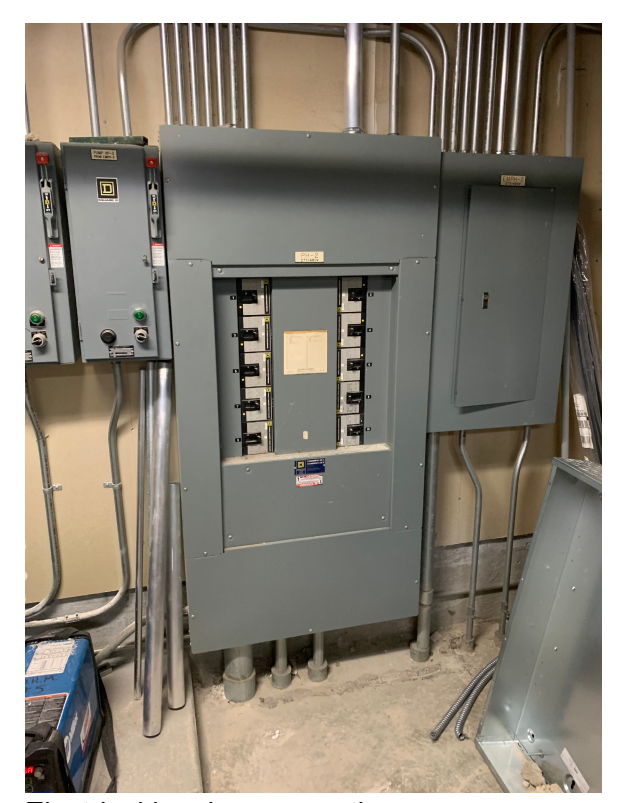
Electrical box in new penthouse.