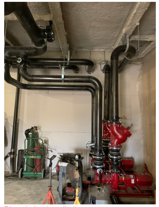
Pipes being installed to pumps.