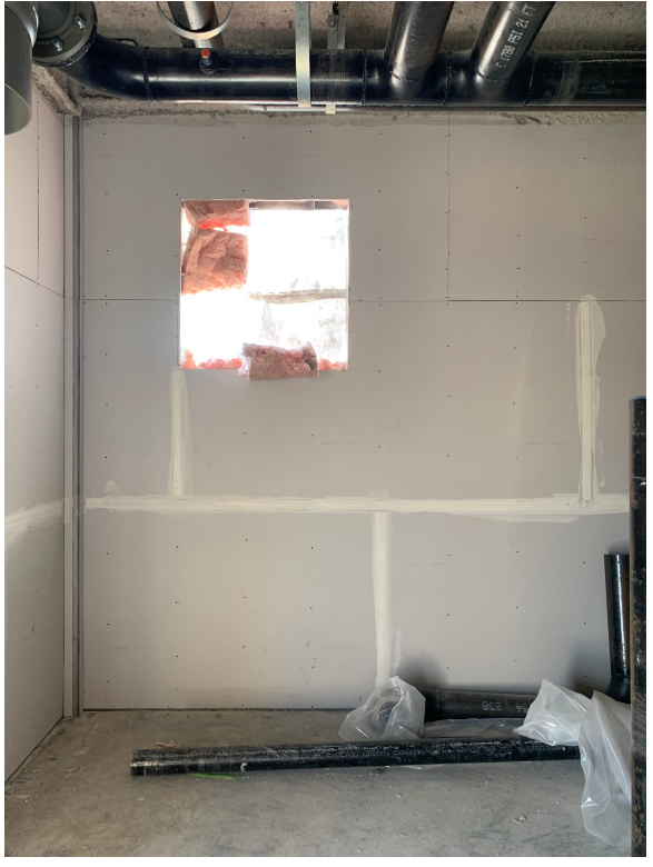
New window in penthouse 2.