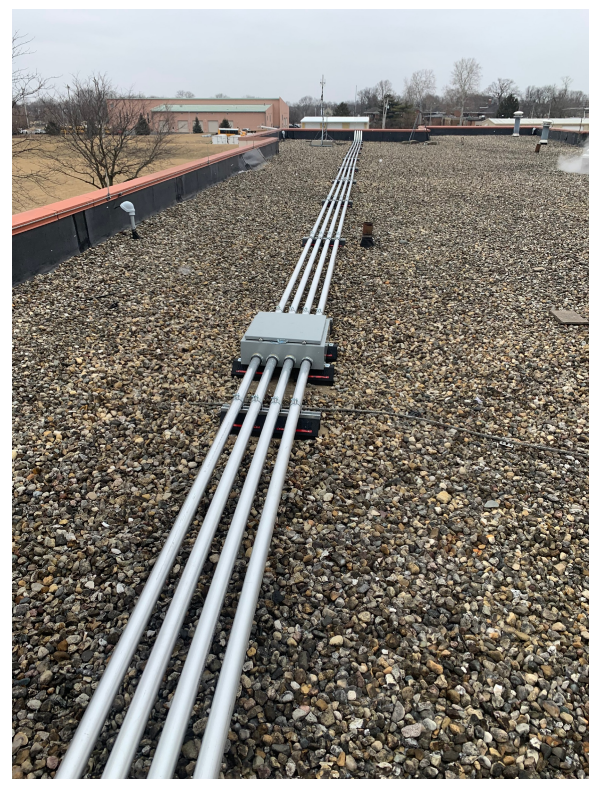
New electrical conduit for chillers.