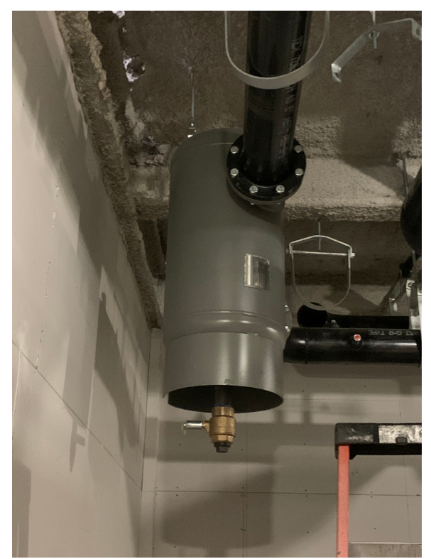
Air separators have been installed.