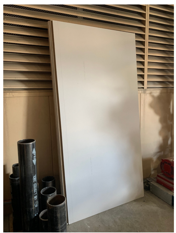
Drywall being installed.