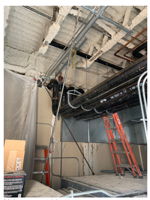
Mains ran outside.