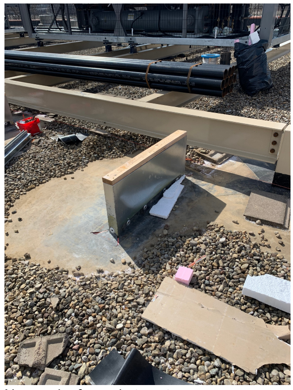
New curbs for main to set on.