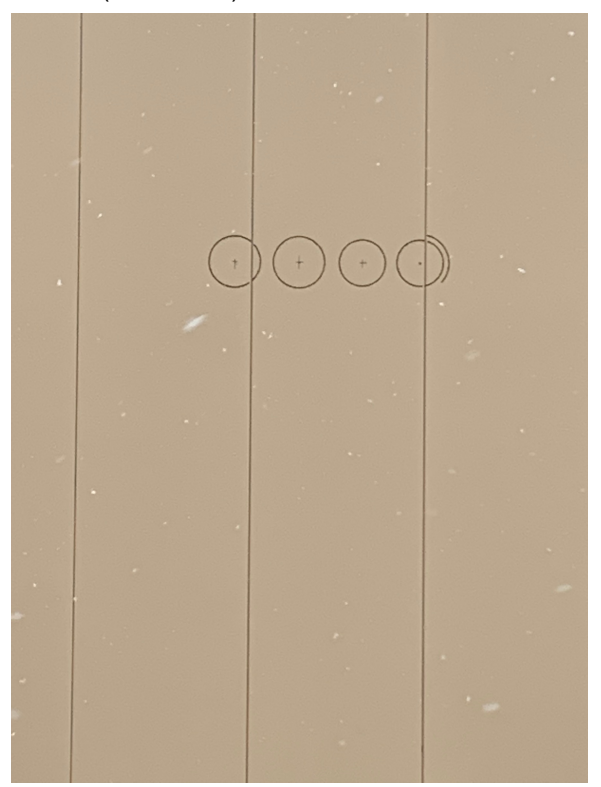
Future penetration on old penthouse.