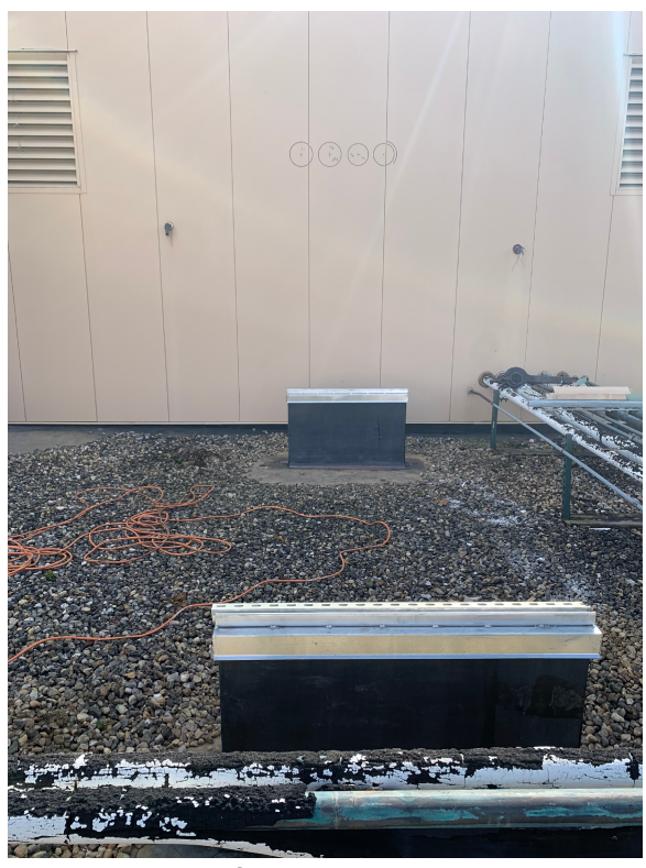
New curbs and future wall penetrations.