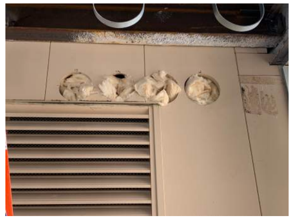
Wall penetration from new penthouse to old penthouse.