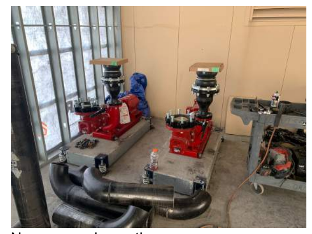
New pumps in penthouse.