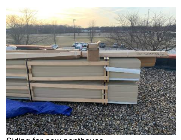
Siding for new penthouse.