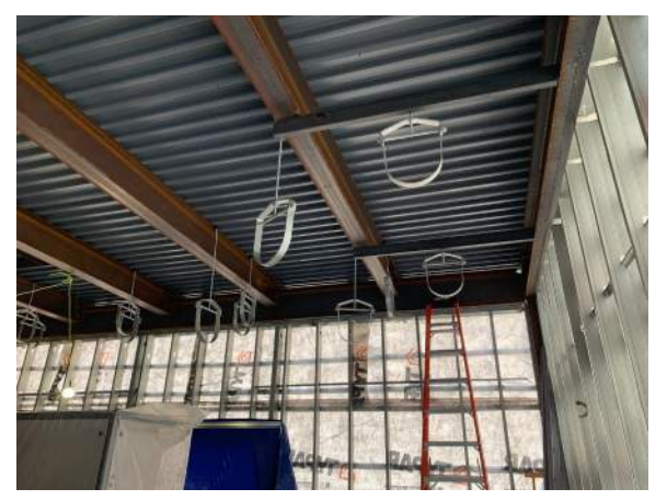
New pipe hangers in new penthouse.